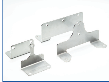
Fig 2. In order to support the heat exchanger Fig 3. Screw Connection It is suitable to use a foot unit at the bottom of the heat exchanger